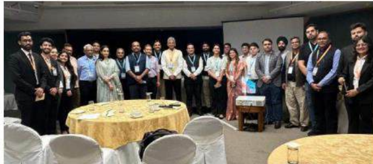
Dignitaries pose for group photograph.

Roundtable 1.0 focused on two main topics: "Exploring Industry's Expectations from a B-School" and "Discussing Avenues of Collaboration Between Industry and Academia." These discussions were moderated by dedicated panel leaders, ensuring a structured and in-depth ex-